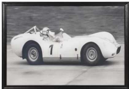
Race Car White

Also available, the image of car no. 1 is a 1958 Lister Jaguar prototype fitted with a 3.0 litre front mounted Jaguar engine. A similar car, driven by Briggs Cunningham, went for auction in August 2013 for USD 1,980,000.00. Briggs Cunningham was a pioneering American racer, his cars were the first to be painted with racing stripes.