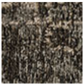
cotton chenille Mapoon