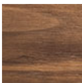
NC walnut canaletto