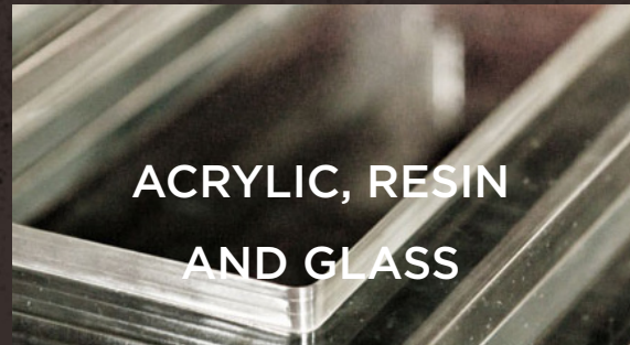
ACRYLIC, RESIN AND GLASS