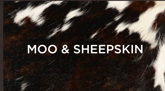
MOO & SHEEPSKIN